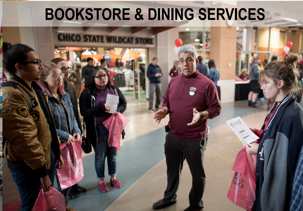
BOOKSTORE & DINING SERVICES